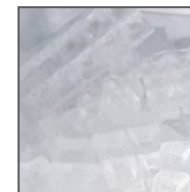
45 square cubes each cycle